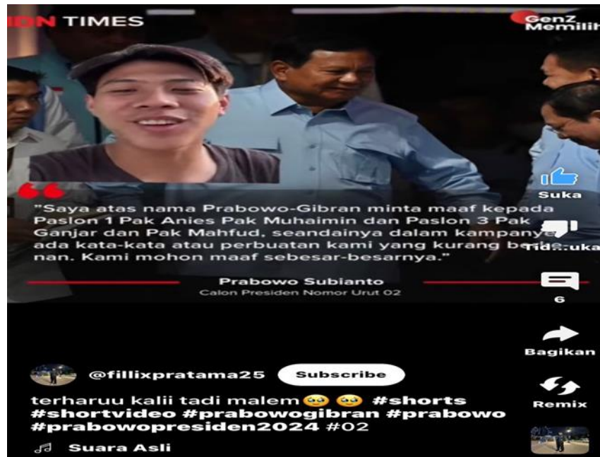
Figure 2. Campaign language style